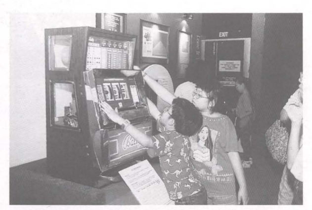
Discovering mathematical probabilities with the aid of a "one arm bandit" machine.

A large collection of mathematical puzzles and games await visitors in this area. The area serves as a cosy corner where visitors can linger while pondering over mathematical puzzles before they end their journey through the land of mathematics.