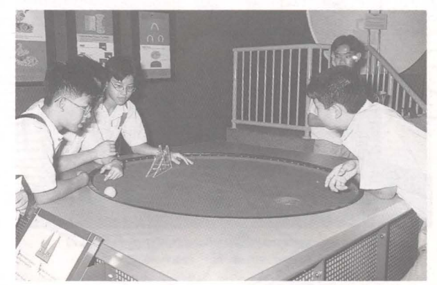
Students discussing the mathematical properties of the elliptical pool table.

The exhibits in this area show the various links between algebra and geometry. Visitors are assured of success on Singapore's only elliptical pool table! A race down the slope is also used to illustrate the interesting fact that the shortest path is not necessarily the fastest path.