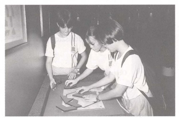
Visitors trying their hands at solving one of the puzzles.