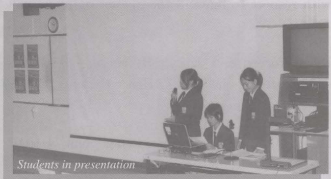
Students in presentation