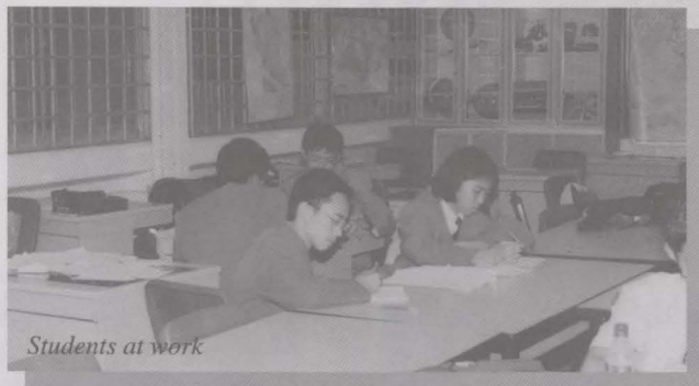
Students at work