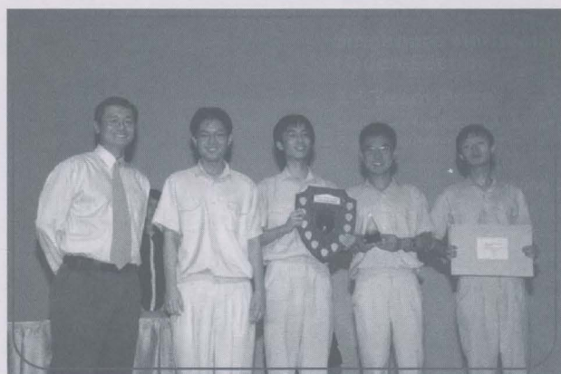
Singapore Mathematical Olympiads 2007 Open Section Team Winner