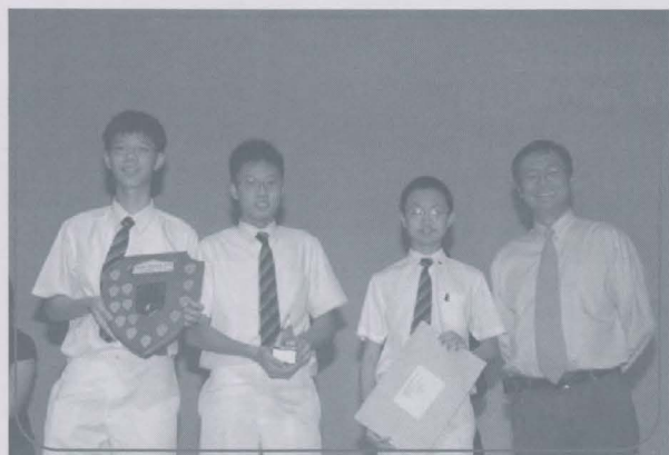
Singapore Mathematical Olympiads 2007 Junior Section Team Winner