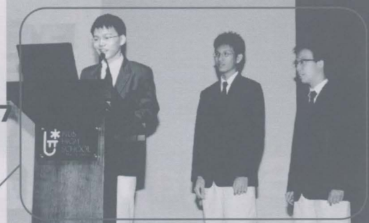
Senior Section Winner

Singapore Mathematical Society Shield, Gold Award, Foo Kean Pew Memorial Prize (Senior Section) Hwa Chong Institution