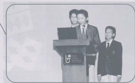
Junior Section Winner